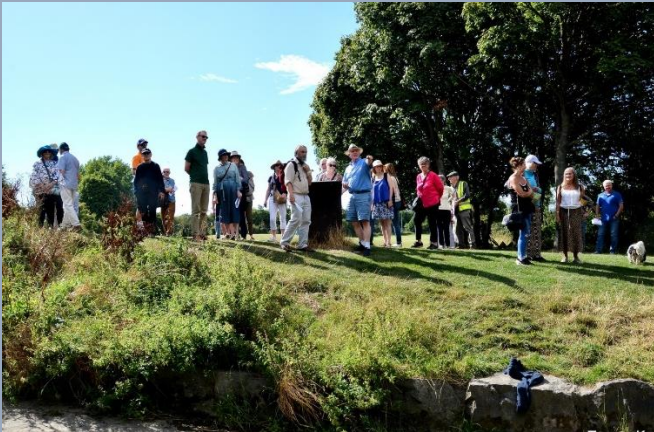
Heritage Week Walk & Talk