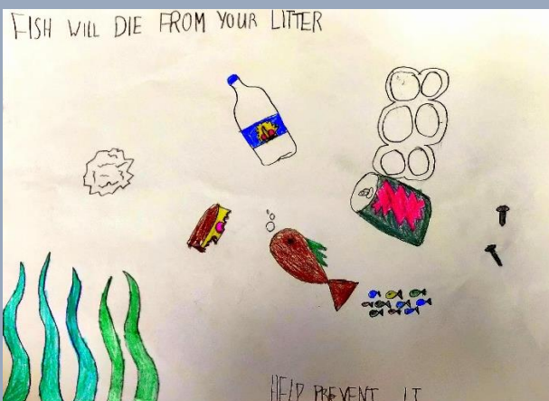
Darragh Flood, age 10, 4th class