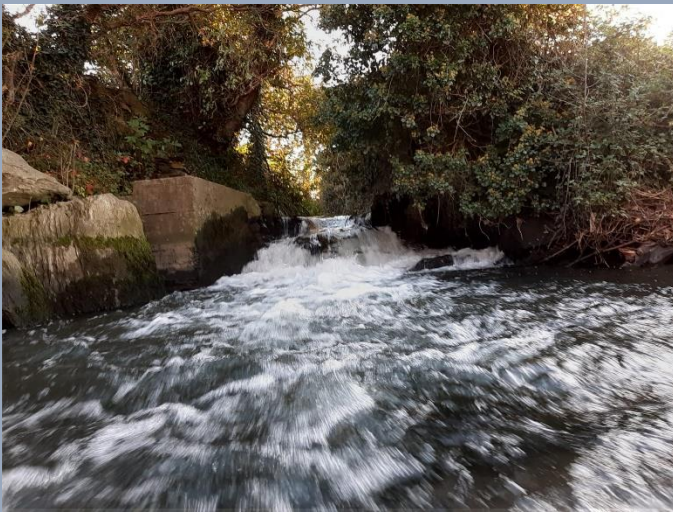
Camac in Clondalkin Community Centre

As part of planning for Camac Flood Alleviation Scheme (CamacFAS), FOTC engaged with the public participation process in 2022, offering historic photos and stories on flooding in the past and sharing the memories and knowledge of our members. We have been told that the outcomes of planning by AECOM, OPW and SDCC will be shared in Q1 of 2023 and we look forward to hearing the proposals for this very significant development in the Camac catchment.