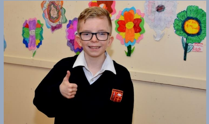
Special mention for Biodiversity Rep. for Our Lady Queen of the Apostles, Jordan!