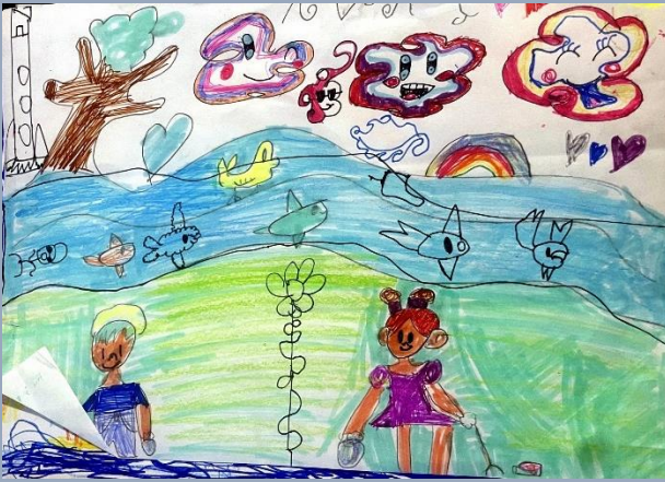
Ava Carberry, 6 mbliana d'aois, Rang 1